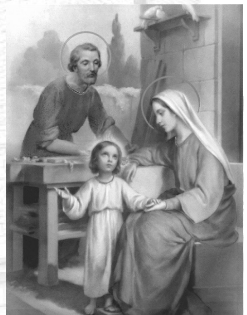
"The Family That Prays Together Stays Together" - Fr. Patrick Peyton, CSC